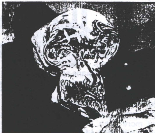
This unusual glass skull, measuring six and a half inches high, was recently found on a local ranch. Investigators will be studying this artifact to try and determine its origins and purpose.

The unusual-looking three-pound skull is asymmetrical and was obviously not made to sit on a mantle, or altar. This asymmetrical nature could be significant and unique. The smooth, graceful lines flow effortlessly through the form, suggesting to one viewer a "prenatal, feminine quality." One verified "unique feature" is the elongated Jaw which twists down and to the left with what appears to be a tongue protruding from between the upper and lower teeth. The nose