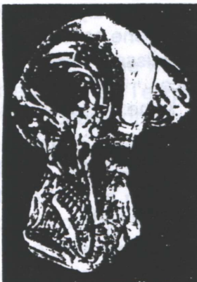
Side view of the glass skull shows the back of the head to be unusually elongated.

Several strange peripheral events have occurred that the rancher family attribute to the mystery skull. In one instance, the discoverer's husband opened up a